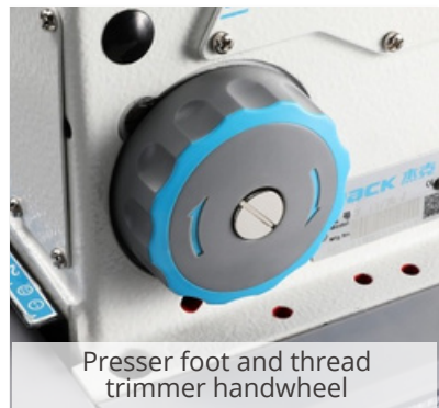
Presser foot and thread trimmer handwheel

Jack's patent technology of stepping motor driving presser foot lifting and thread trimmer, adopts closed-loop control system, make it precise control and convenient adjustment, with needle protection function to prevent needle breakage; the presser foot lifting sound is 3.5 decibels lighter than ordinary electromagnets, which solves the problem of electromagnet's weakness and durability, faster response and higher efficiency; the presser foot can also be lifted by hand-wheel in the power-off state, which is easy to adjust.