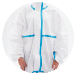
medical protective clothing

Hot-air seam sealing machine is mainly used for seam sealing. It is a glue reinforcement process. The adhesive tape at the seam is heated by the machine, and the pressure roller is continuously rotated to feed and pressurize, and the tape is closely adhered to the fabric, to prevent water, bacteria, viruses, air, etc. from intruding into the inner side through the seam to achieve protection. It is widely used for products such as medical protective clothing, waterproof shoes, diving suits, sports suits, mountaineering suits, waterproof bags, raincoats, tents and awnings etc.