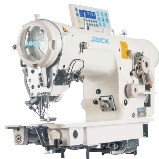
JK-2284B suitable for women's underwear , jackets, gloves, elastic reinforcement and other products zigzag sewing.

Item: High speed computerized zigzag stitching machine Features: High Efficiency; Good Quality; Easy to Use